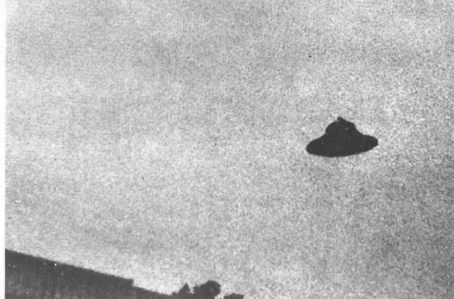
▲ Adamski-type UFO over Onomichi.

Immediately upon publishing his first book, George Adamski became a target of criticism, blame, and reproach by a great number of people. Many of them would claim