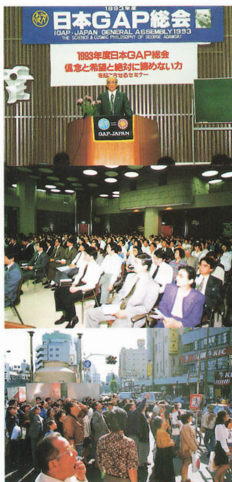
▲ Top: 1993 GAP-Japan General Assembly held in Tokyo on October 10, 1993.