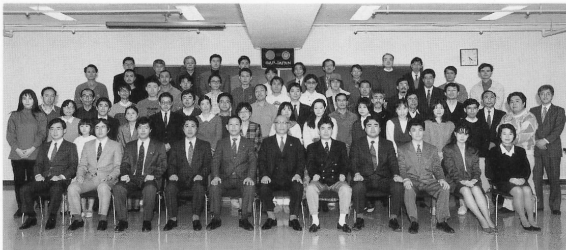
▲ GAP-Japan Tokyo monthly meeting.